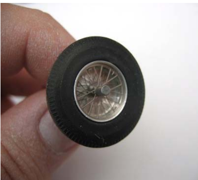
7. MAKE SURE EDGES ARE AGAINST RIM OF WHEEL ALL ROUND