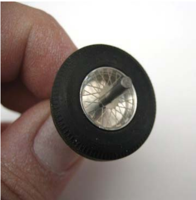
4. DROP ONE OF THE REAR PHOTO ETCH PIECES (WITHOUT OUTER RING) ONTO AXLE