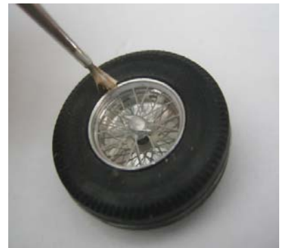
9. RUN A BEAD OF WHITE GLUE AROUND OUTER EDGE AND KNOCK OFF AND ALLOW TO DRY.

10. WHEELS ARE NOW READY TO FIT TO A TRRC KIT OF YOUR CHOICE!