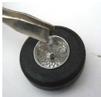
8. USING TWEEZERS INSERT WHITE METAL KNOCK OFF