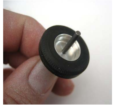
3. INSERT A SPARE AXLE THROUGH WHEEL