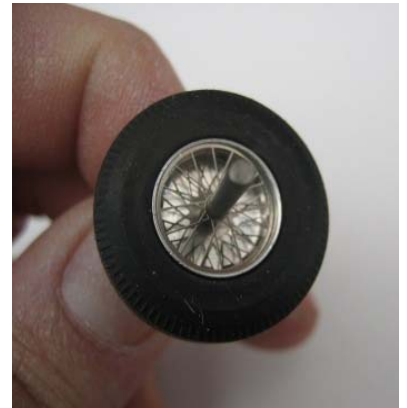
6. DROP ON THE FRONT PHOTO-ETCH PIECE ONTO AXLE.