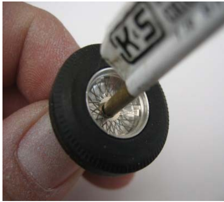
5. USING A SPARE PIECE OF 1/8" TUBE PUSH THE CENTRE OF THE PHOTO-ETCH TO THE BACK FACE OF THE WHEEL TO FORM A CONE SHAPE.