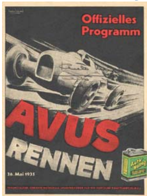
1935 PROGRAMME COVER

GP006 FOR 1935 THE AVUS-RENNEN WAS SPLIT UP INTO TWO HEATS AND A FINAL. THE MERCEDES AND AUTO UNION TEAMS TURNED UP WITH SEVERAL STREAMLINERS AND FERRARI WITH AN ALFA ROMEO 'BI-MOTORE'. HANNS GEIER RACED A SPEED RECORD CAR - WHICH CARACCIOLA USED TO SET NEW WORLD RECORDS WITH IN 1934 - A SPECIAL W25 COUPE WITH A COCKPIT THAT COULD ONLY BE OPENED FROM THE OUTSIDE!